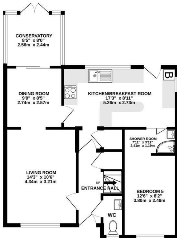
GROUND FLOOR 659 sq.ft. (61.2 sq.m.) approx.