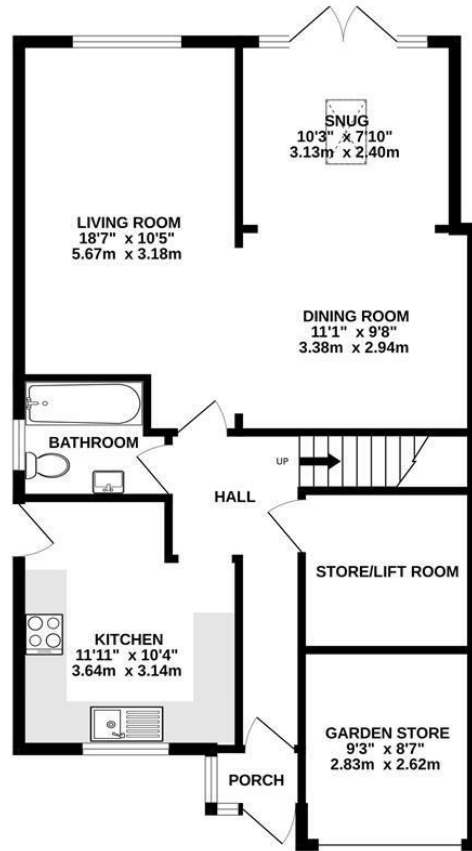
GROUND FLOOR 768 sq.ft. (71.3 sq.m.) approx.