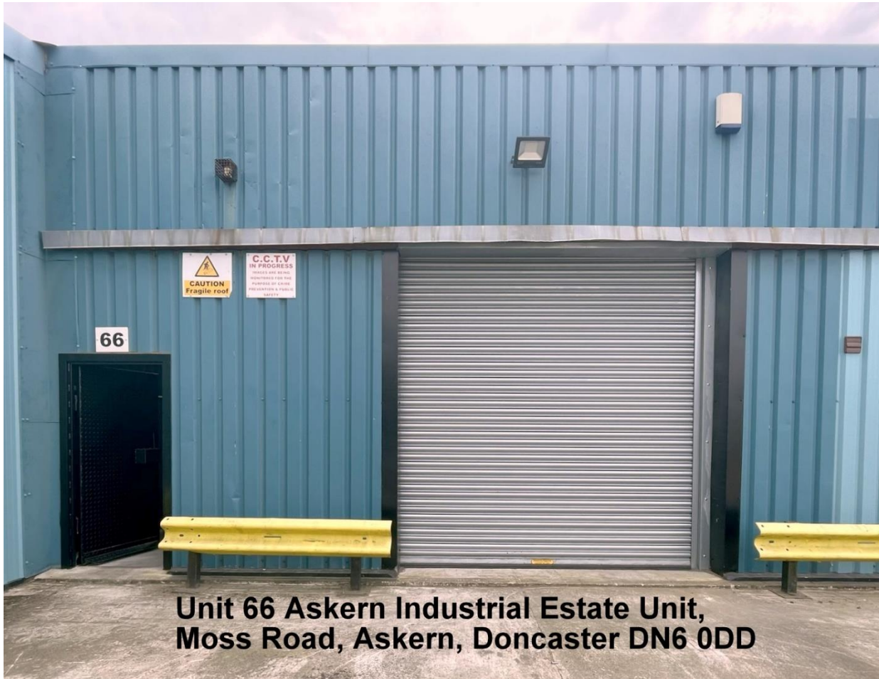
Unit 66 Askern Industrial Estate Unit, Moss Road, Askern, Doncaster DN6 0DD