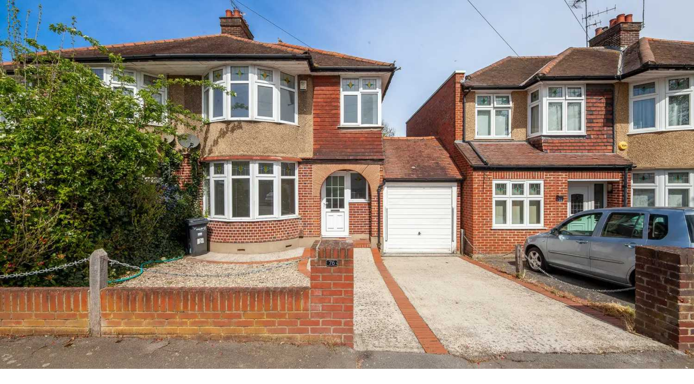
76 Beverley Crescent, Woodford Green