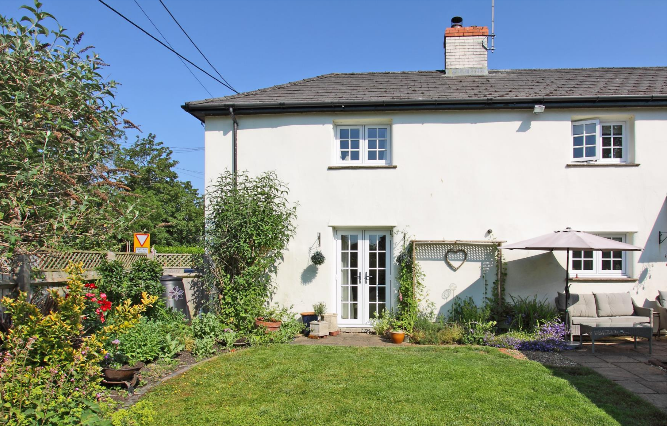
Ringwold Cottage, Nether Wallop