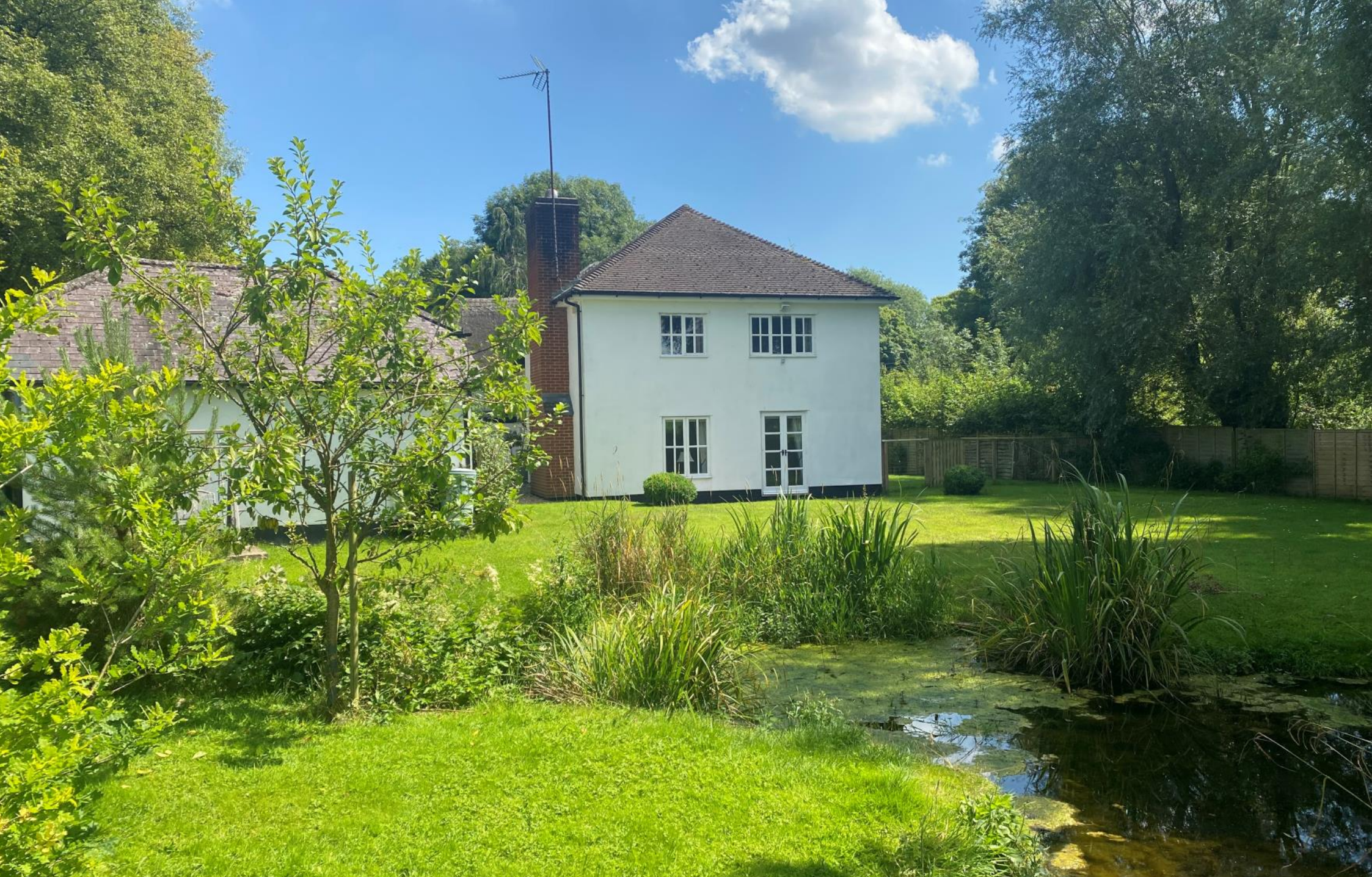
Cob Cottage, Nether Wallop