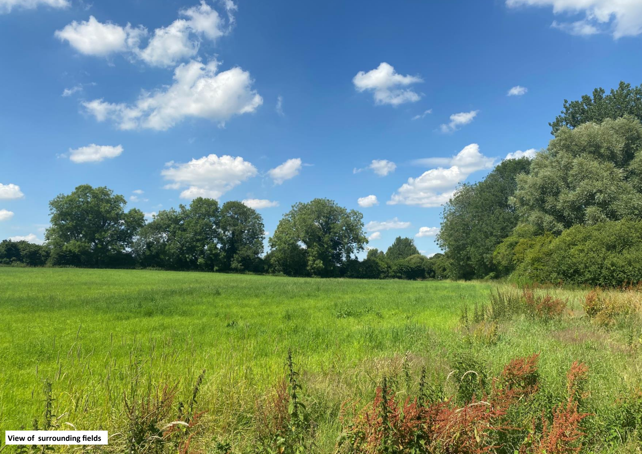
View of surrounding fields