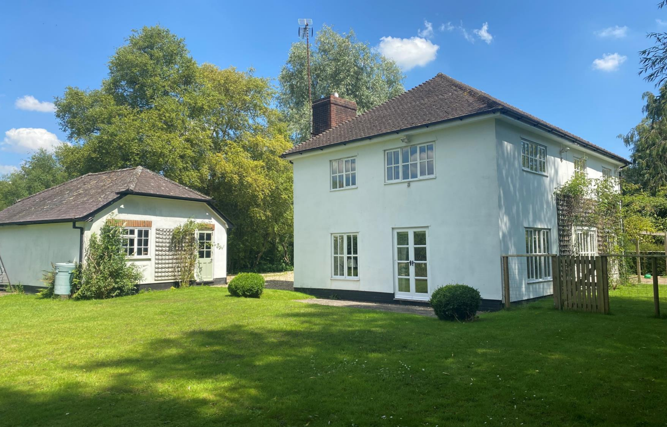
Cob Cottage, Nether Wallop