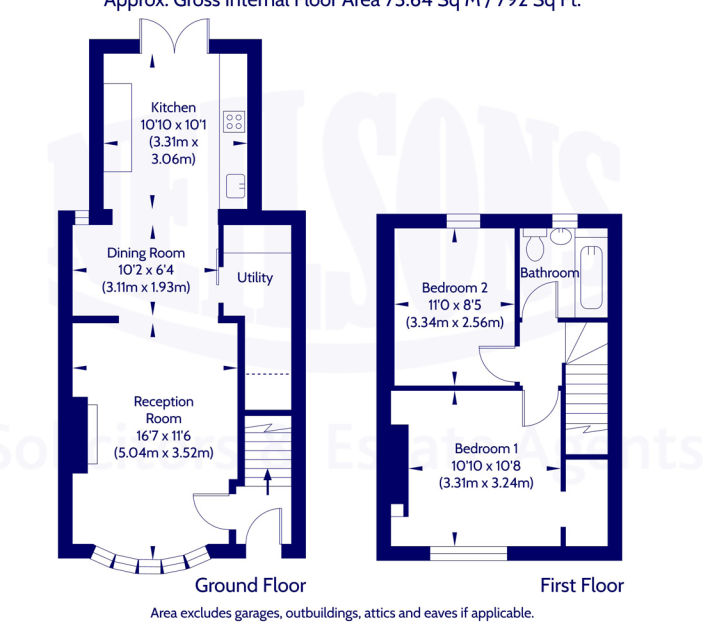
Area excludes garages, outbuildings, attics and eaves if applicable. All measurements are approximate. Not to scale. For identification only. © 2024 Neilsons Solicitors & Estate Agents. Plans by Planography.co.uk

Whilst we endeavour to ensure that our sales particulars are accurate and reliable, the following general points should be noted with regard to the extent of our investigations prior to marketing the property and therefore if any particular aspect is of crucial relevance to you, please contact this office for verification particularly if you are contemplating travelling some distance to view.