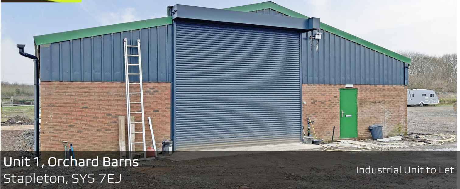
Unit 1, Orchard Barns Stapleton, SY5 7EJ