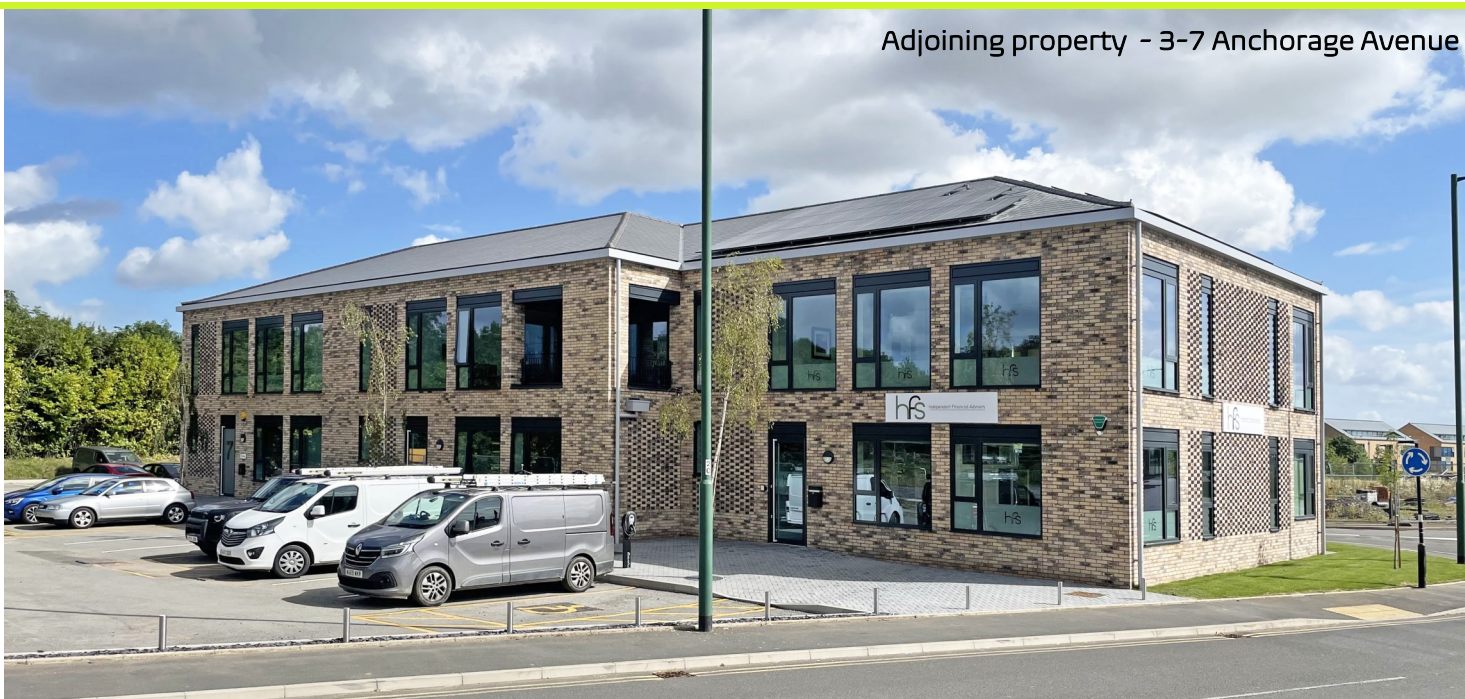
Adjoining property - 3-7 Anchorage Avenue