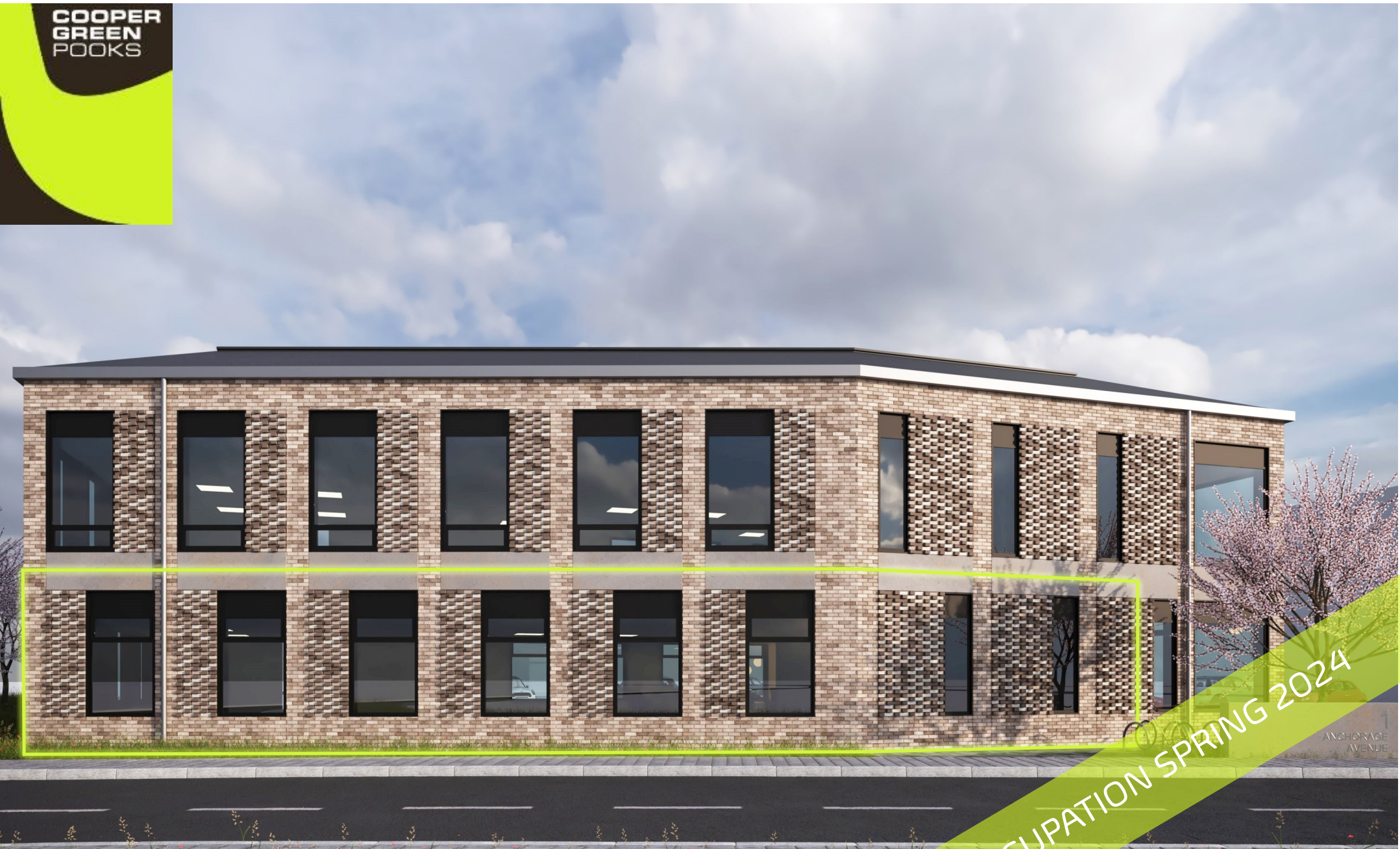
Elevation from Anchorage Avenue

One Anchorage Avenue Shrewsbury Business Park, Shrewsbury, SY2 6FG