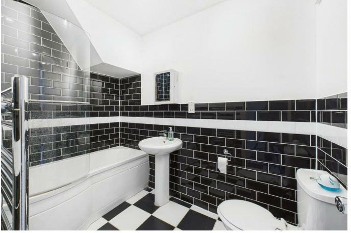
You may download, store and use the material for your own personal use and research. You may not republish, retransmit, redistribute or otherwise make the material available to any party or make the same available on any website. These particulars, whilst believed to be accurate are set out as a general outline only for guidance and do not constitute any part of an offer or contract. Intending purchasers should not rely on them as statements or representation of fact, but must satisfy themselves by inspection or otherwise as to their accuracy. No person in this firms employment has the authority to make or give any representation or warranty in respect of the property.