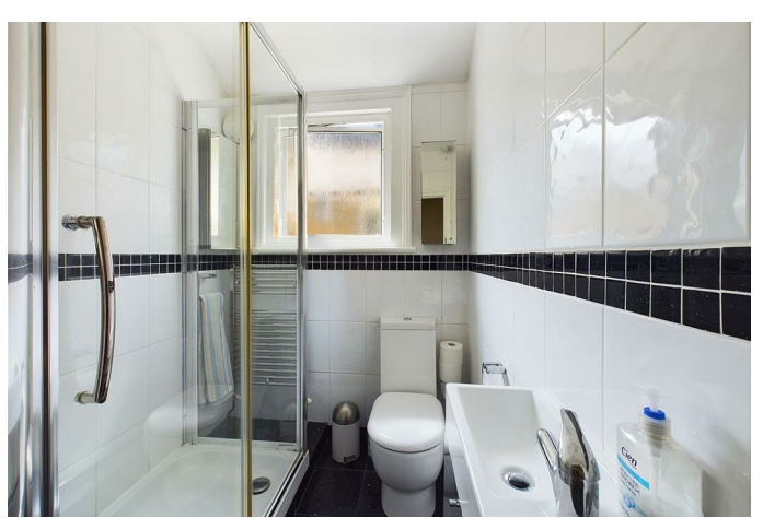
You may download, store and use the material for your own personal use and research. You may not republish, retransmit, redistribute or otherwise make the material available to any party or make the same available on any website. These particulars, whilst believed to be accurate are set out as a general outline only for guidance and do not constitute any part of an offer or contract. Intending purchasers should not rely on them as statements or representation of fact, but must satisfy themselves by inspection or otherwise as to their accuracy. No person in this firms employment has the authority to make or give any representation or warranty in respect of the property.