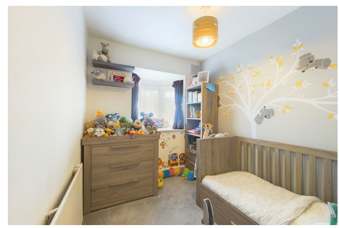
You may download, store and use the material for your own personal use and research. You may not republish, retransmit, redistribute or otherwise make the material available to any party or make the same available on any website. These particulars, whilst believed to be accurate are set out as a general outline only for guidance and do not constitute any part of an offer or contract. Intending purchasers should not rely on them as statements or representation of fact, but must satisfy themselves by inspection or otherwise as to their accuracy. No person in this firms employment has the authority to make or give any representation or warranty in respect of the property.