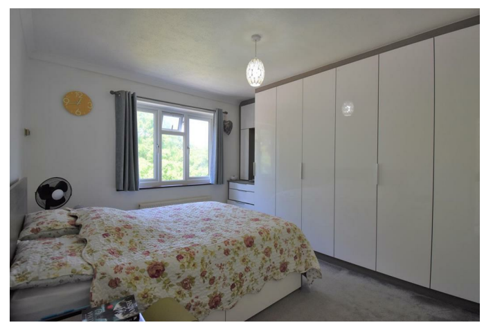
You may download, store and use the material for your own personal use and research. You may not republish, retransmit, redistribute or otherwise make the material available to any party or make the same available on any website. These particulars, whilst believed to be accurate are set out as a general outline only for guidance and do not constitute any part of an offer or contract. Intending purchasers should not rely on them as statements or representation of fact, but must satisfy themselves by inspection or otherwise as to their accuracy. No person in this firms employment has the authority to make or give any representation or warranty in respect of the property.