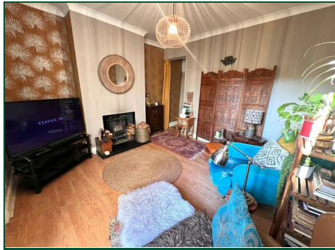
GROUND FLOOR 400 sq. ft. (37.2 sq. m.) approx.