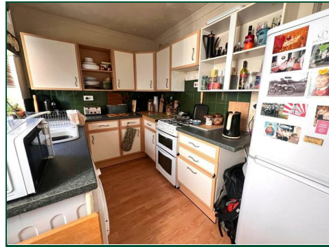
1ST FLOOR 400 sq. ft. (37.2 sq. m.) approx.