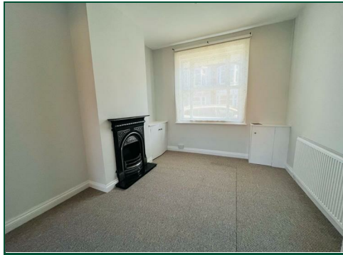
GROUND FLOOR 445 sq.ft. (41.3 sq.m.) approx.