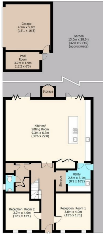
Ground Floor Approx. 132 Sq. meters (1421 Sq. feet)