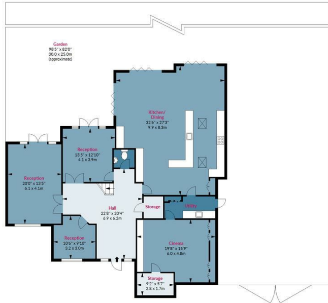
Ground Floor Floor Area 2134 Sq Ft - 198.25 Sq M