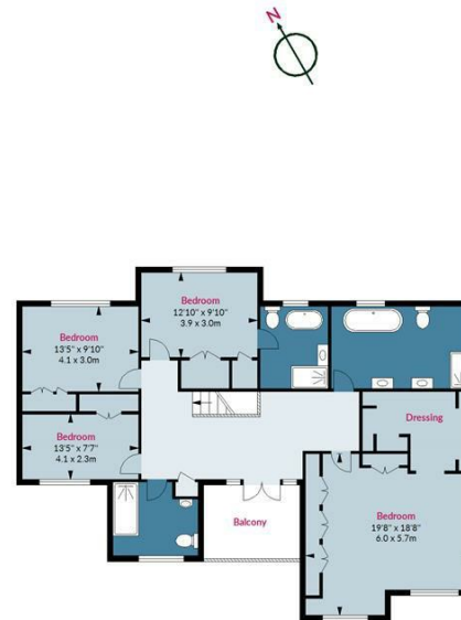
First Floor Floor Area 1459 Sq Ft - 135.54 Sq M