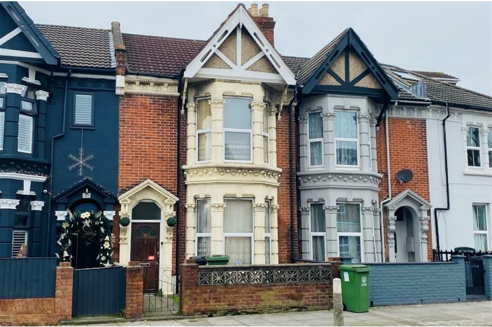
Copnor Road, Portsmouth, PO3 5AB Asking Price £325,000 Freehold