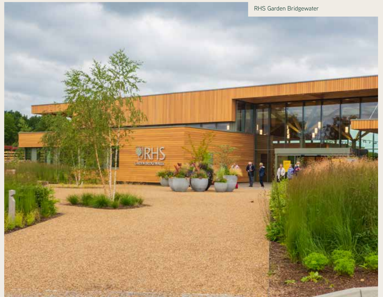
RHS Garden Bridgewater