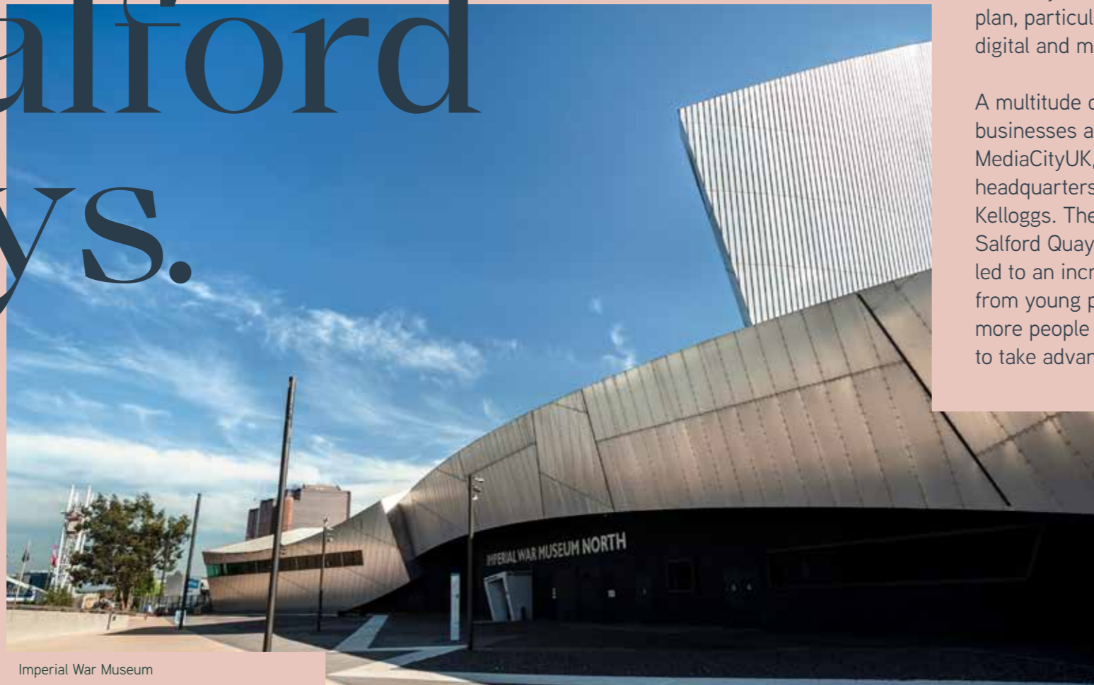
Imperial War Museum

"The BBC employs over 4,000 people in Salford with further plans for expansion".