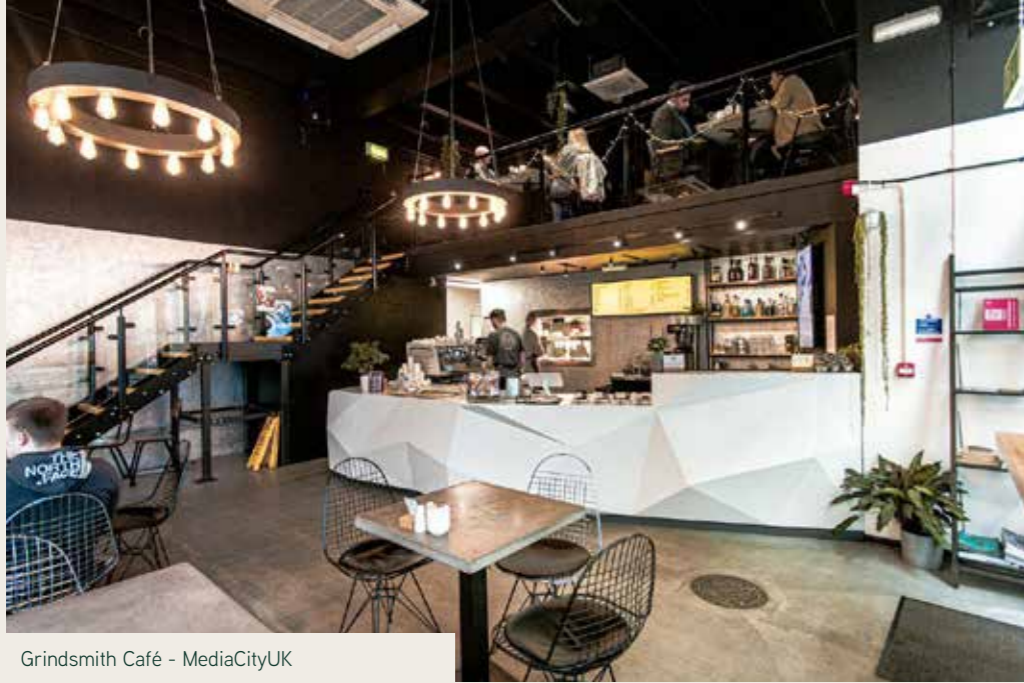
Grindsmith Café - MediaCityUK