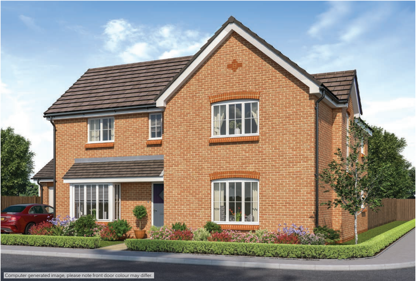
Computer generated image, please note front door colour may differ.