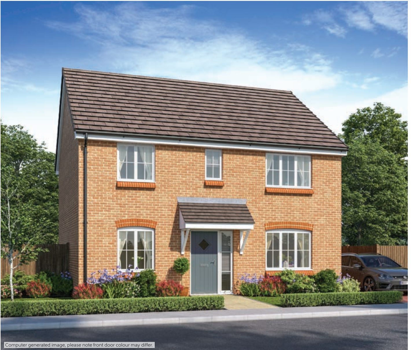
Computer generated image, please note front door colour may differ.