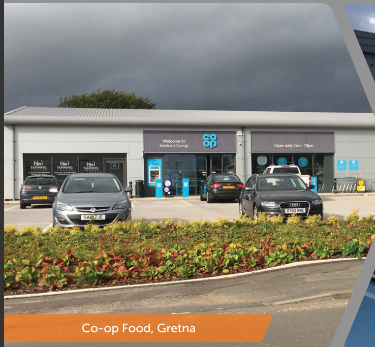
Co-op Food, Gretna