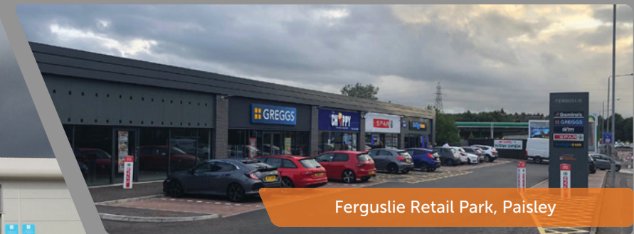
Ferguslie Retail Park, Paisley