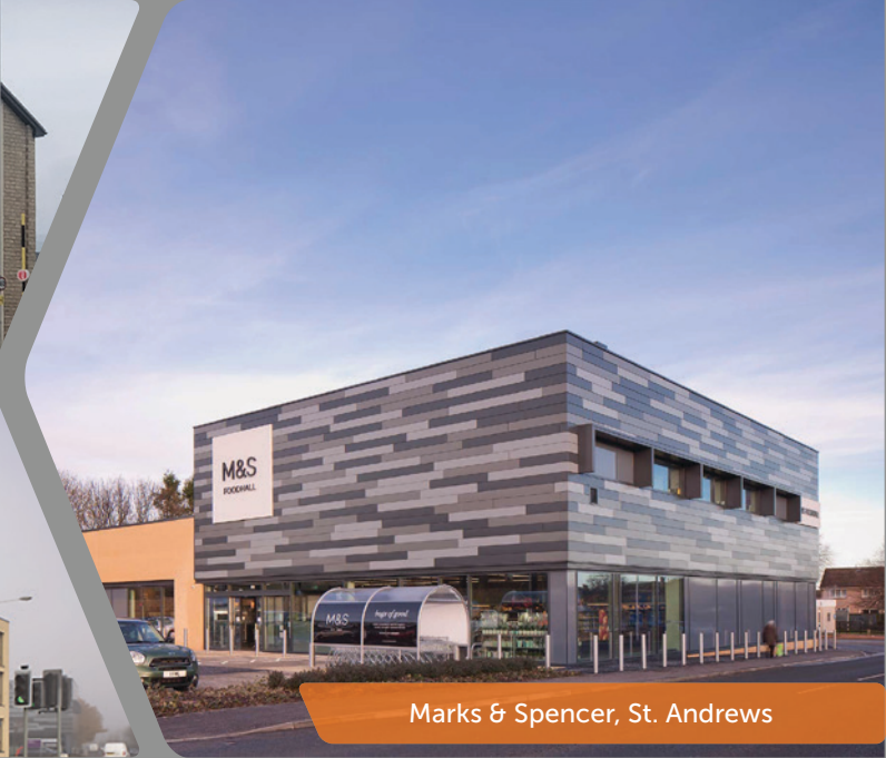
Marks & Spencer, St. Andrews