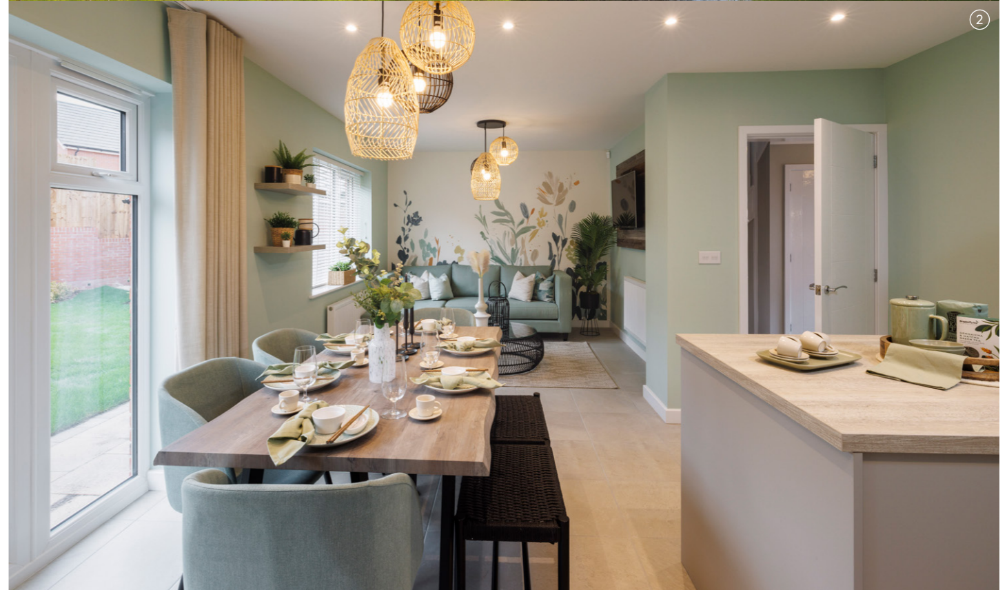
① ← Beamish Place ② ← Typical Interior