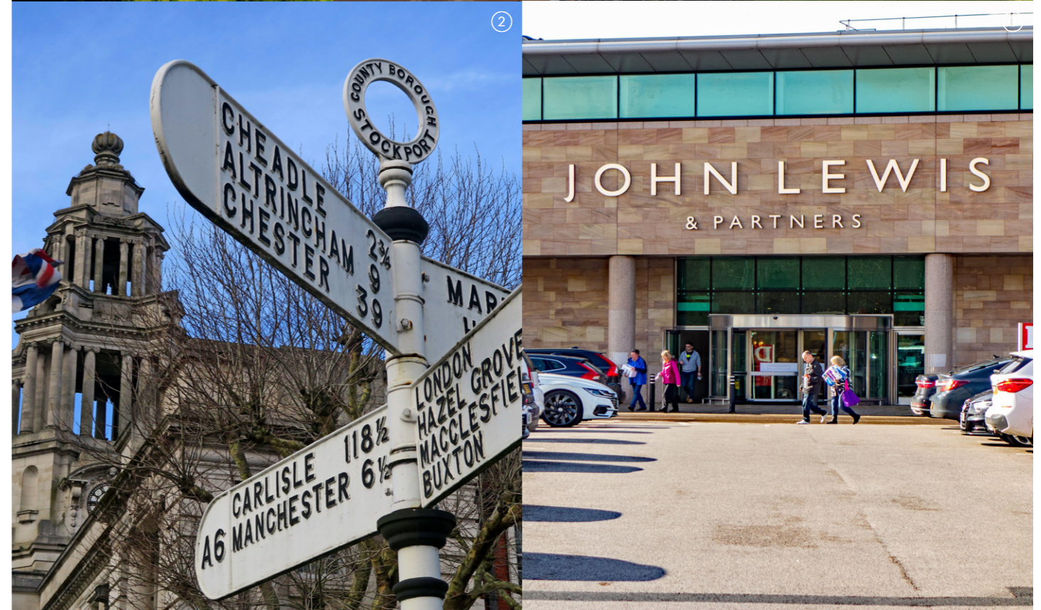
① → Bluebell Green ② → Cheadle Directional Signage ③ → John Lewis Department Store, Cheadle