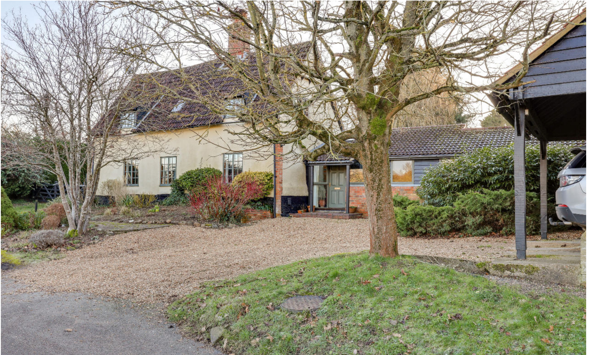
View Farm, Caxton End, Bourn, Cambridge