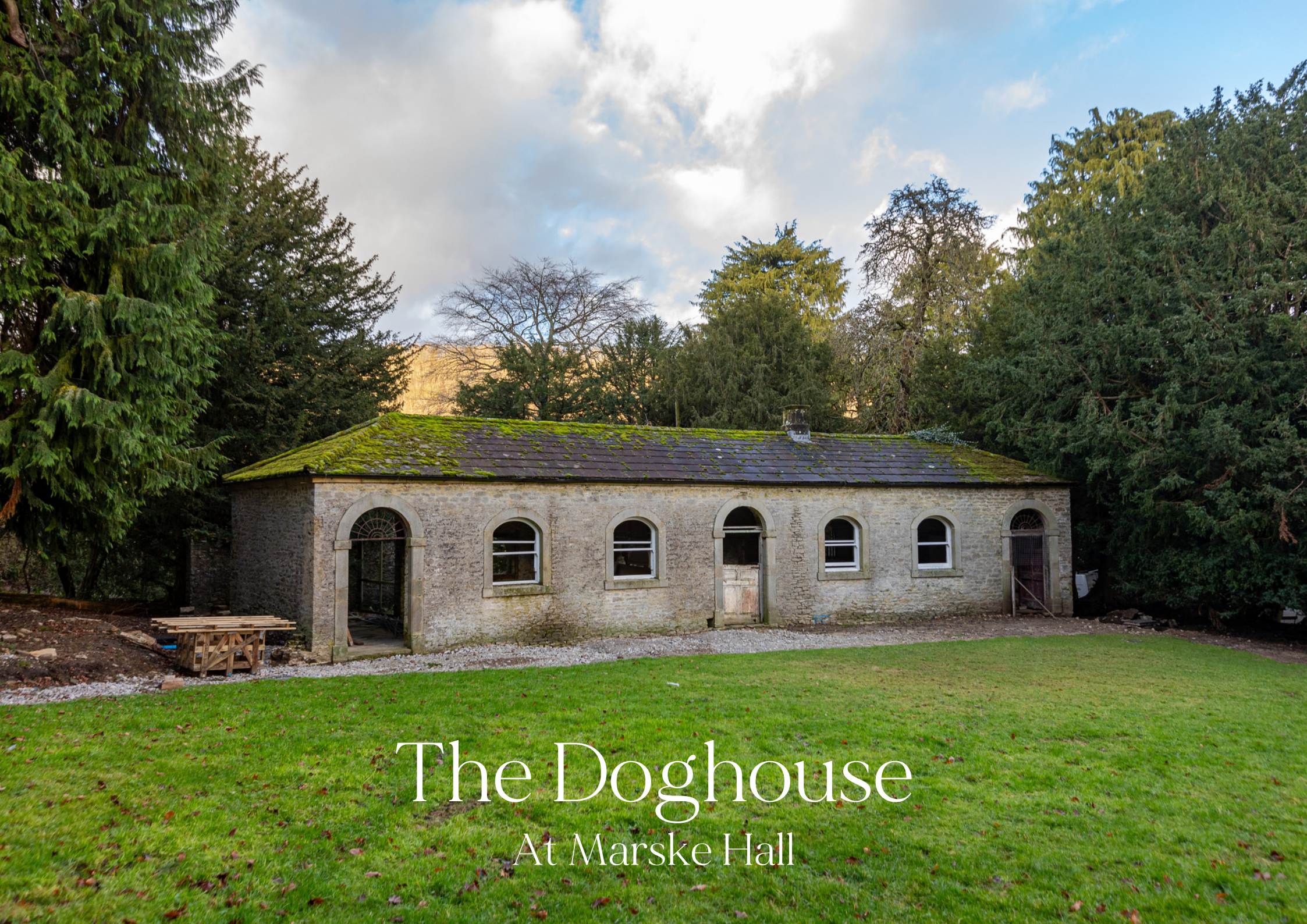
The Doghouse At Marske Hall