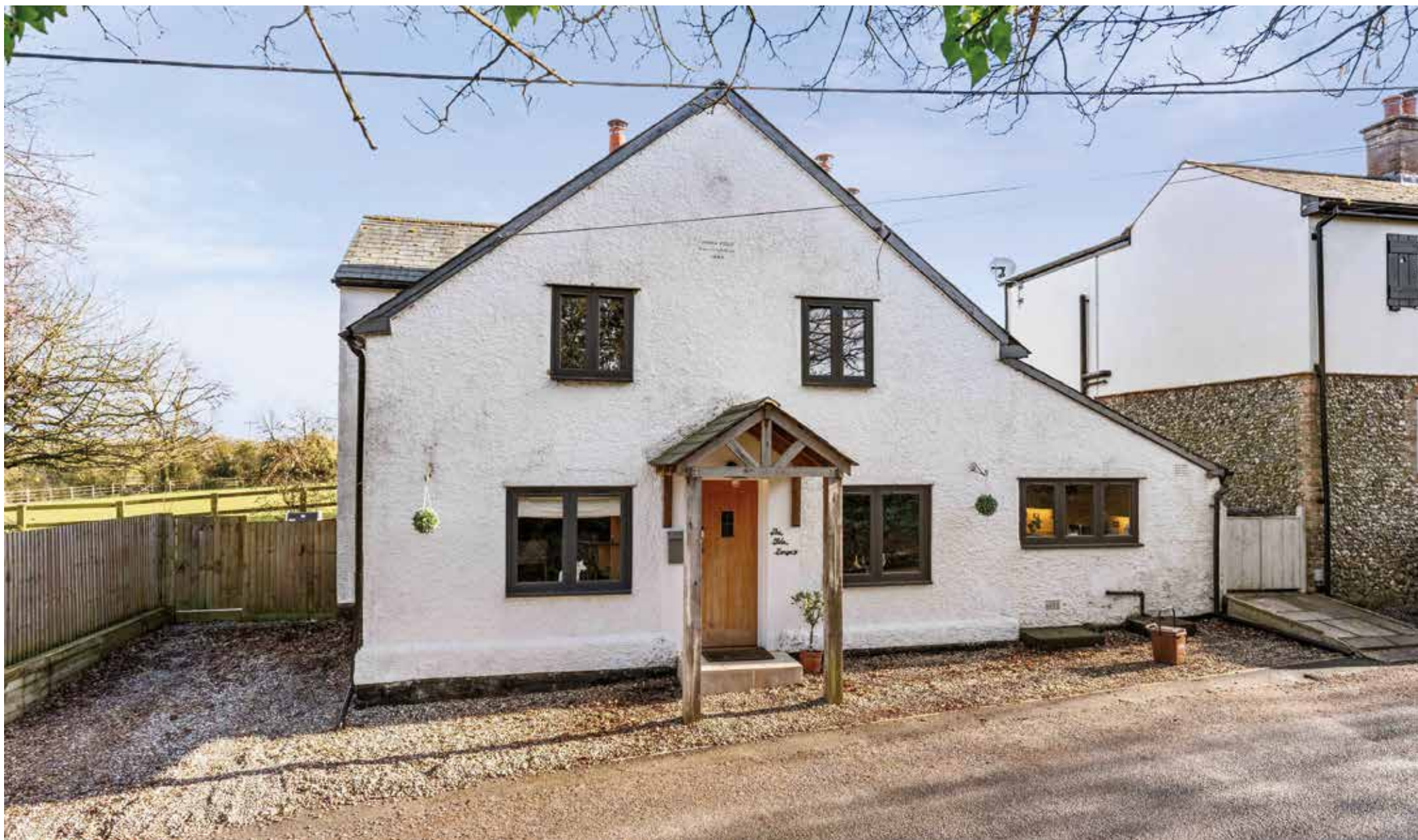
The Olde Forge Redhill | Hertfordshire | SG9 0TH