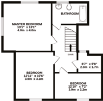
1ST FLOOR 578 sq ft. (53.7 sq.m.) approx.