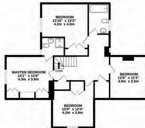
1ST FLOOR 932 sq.ft. (86.6 sq.m.) approx.