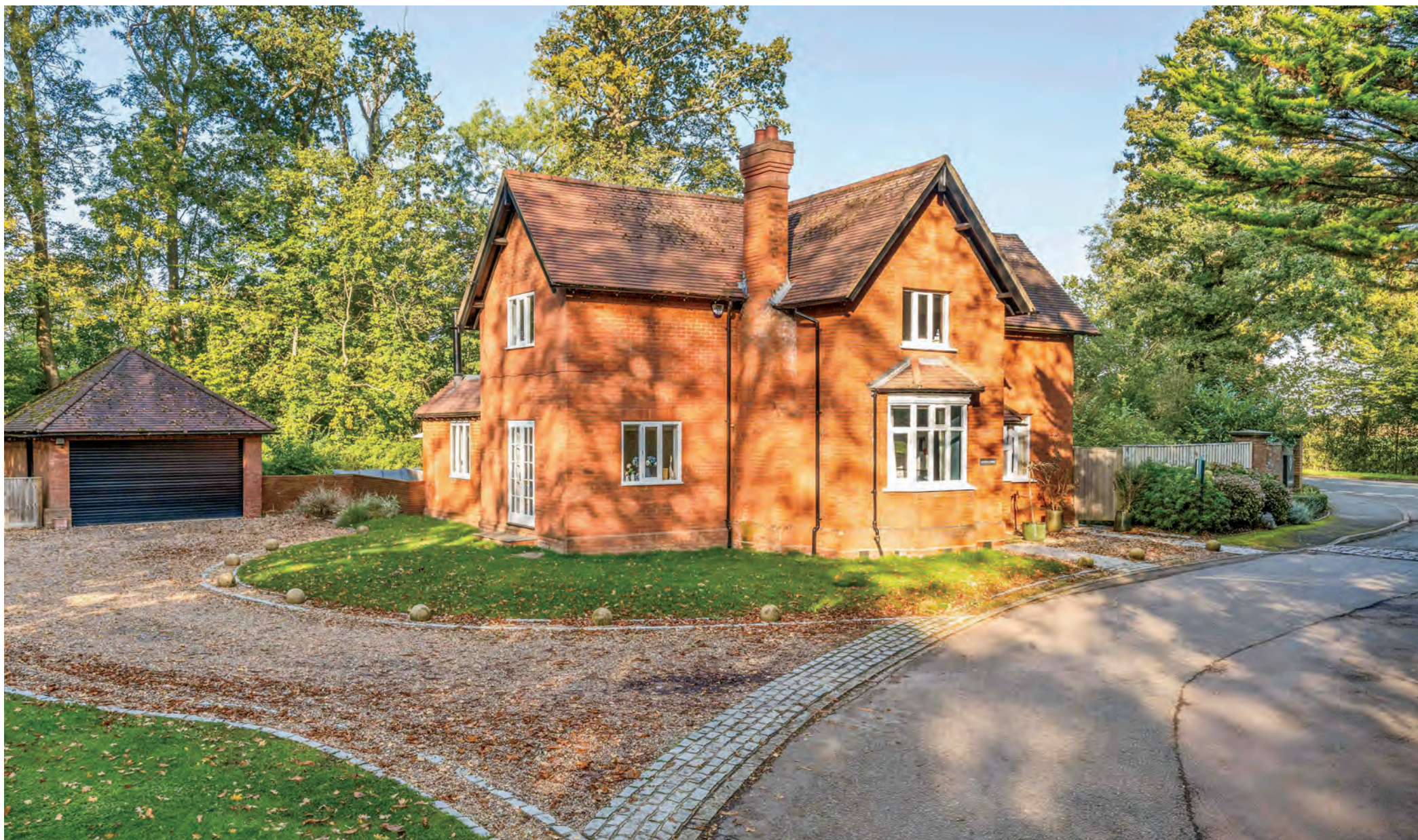
North Lodge Cambridge Road | Thundridge | Ware | Hertfordshire | SG12 0SD