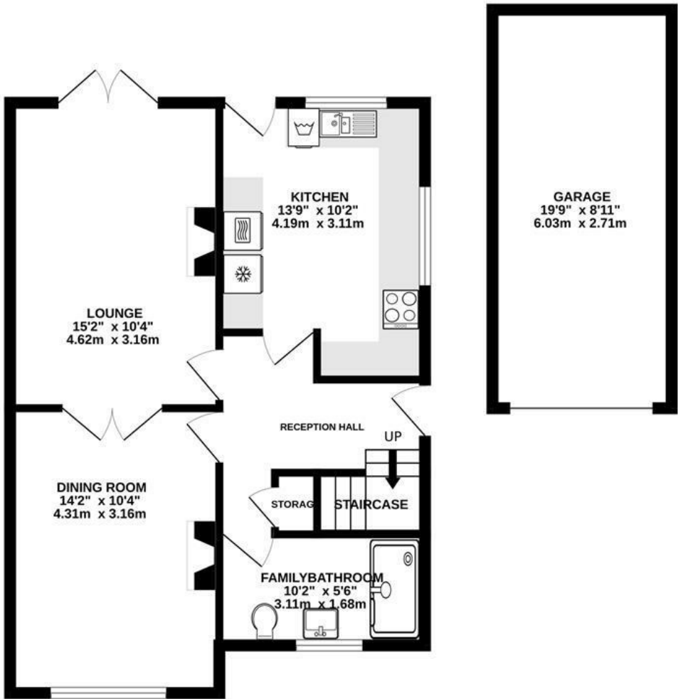
GROUND FLOOR 745 sq.ft. (69.2 sq.m.) approx.