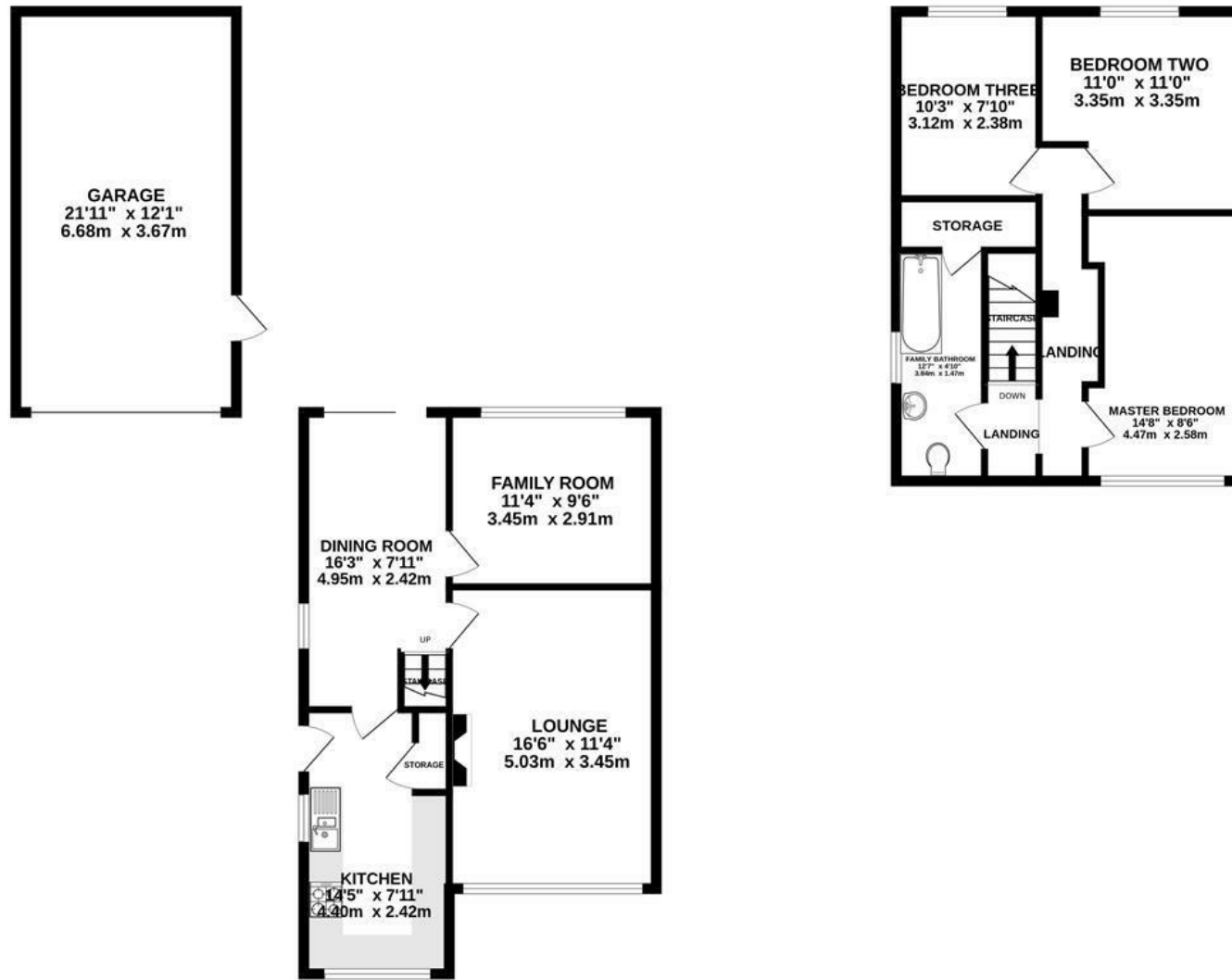
TOTAL FLOOR AREA: 1279 sq.ft. (118.9 sq.m.) approx.

Whilst every attempt has been made to ensure the accuracy of the floorplan contained here, measurements of doors, windows, rooms and any other items are approximate and no responsibility is taken for any error, omission or mis-statement. This plan is for illustrative purposes only and should be used as such by any prospective purchaser. The services, systems and appliances shown have not been tested and no guarantee as to their operability or efficiency can be given. Made with Metropix ©2024