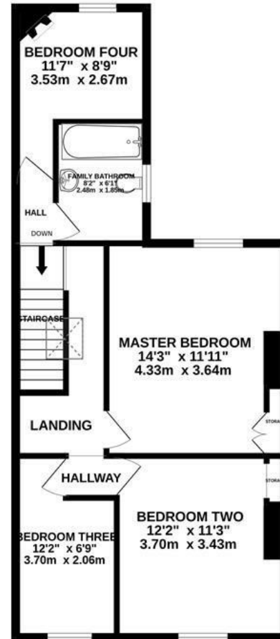
1ST FLOOR 601 sq.ft. (55.9 sq.m.) approx.