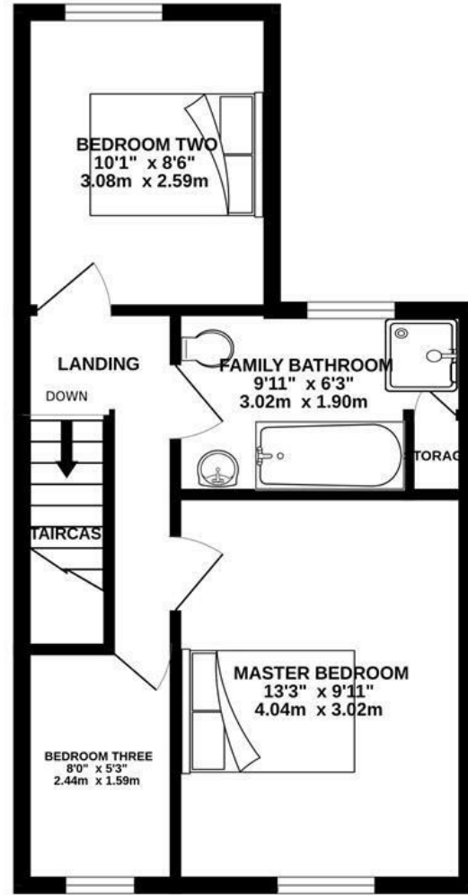
1ST FLOOR 380 sq.ft. (35.3 sq.m.) approx.