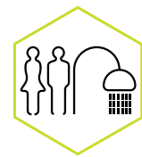
WCs and shower facilities