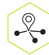
City centre location