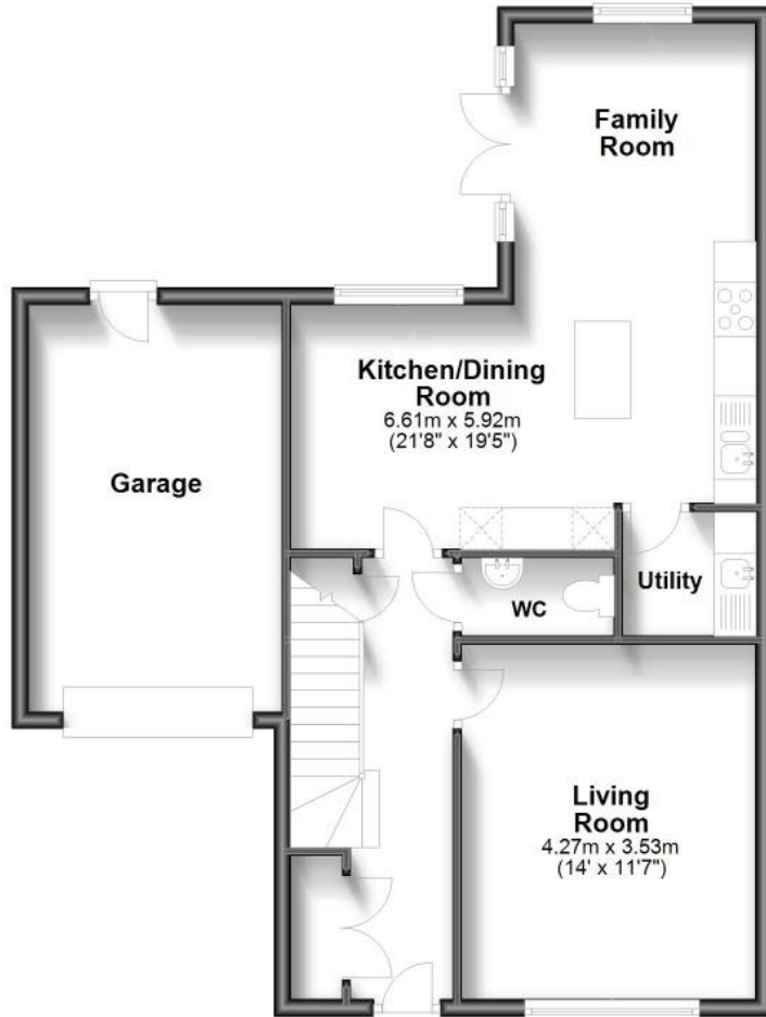
Ground Floor Approx. 69.1 sq. metres (743.5 sq. feet)