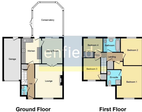
This plan is for illustration purposes only and may not be representative of the property. Plan not to scale.