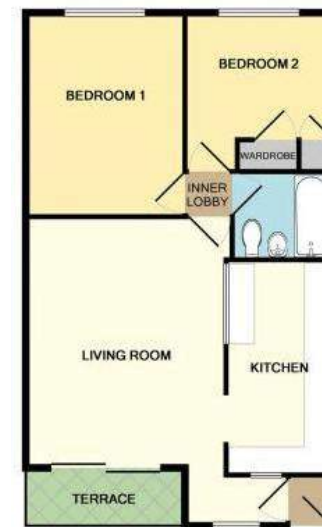
This Floor Plan is for guidance only and is NOT to SCALE Made with Metropix ©2015

Spacious two bedroom ground floor apartment situated within the popular residential area of Bishopstoke, located near to local amenities, schools, bus routes and good transport links to the surrounding areas. Bishopstoke is a village situated on the eastern bank of the River Itchen. The ancient woodland of Stoke Park Woods is a short walk away and is ideal for a peaceful walk or adventurous bike ride. The accommodation on offer comprises of a spacious living room with door access leading to a small terrace area and the communal gardens, modern fitted kitchen with space and plumbing for household appliances, family bathroom with white suite and two double bedrooms with bedroom two benefitting from fitted wardrobes and storage cupboard. Additional benefits include double glazing and heating throughout. Externally there is an allocated parking space and access to the well tended communal gardens. The Service Charge £1,300.00 per annum.