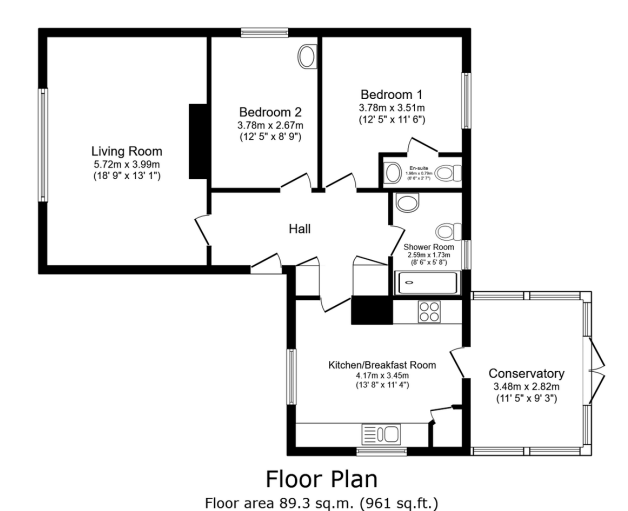
TOTAL: 89.3 sq.m. (961 sq.ft.)

ils floor plan is for illustrative purposes only. It is not drawn to scale. Any measurements, floor areas (including any total floor area), openings and orientations are sproximate. No details are guaranteed, they cannot be relied upon for any purpose and do not form any part of any agreement. No liability is taken for any error, omission of