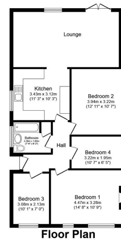
Total floor area 85.2 m 2 (917 sq.ft.) approx This plan is for illustration purposes only and may not be representative of the property. Plan not to scale. Powered by PropertyBox

***GUIDE PRICE £325,000-£350,000*** Situated within a short distance of The New Forest National Park, local shops and bus routes is this well presented extended detached family bungalow.