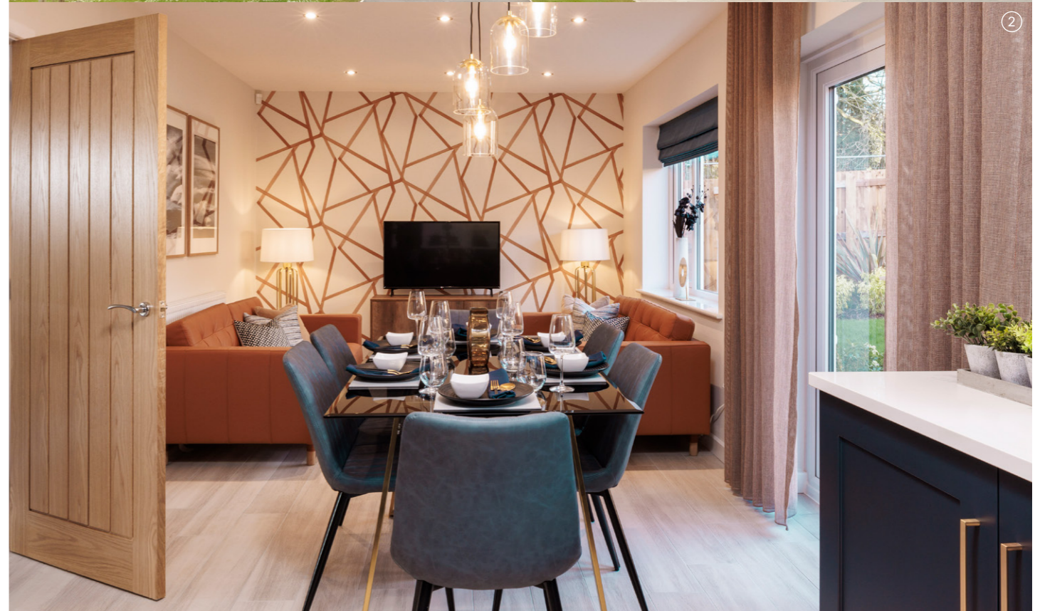
① ← Beamish Place ② ← Typical Interior