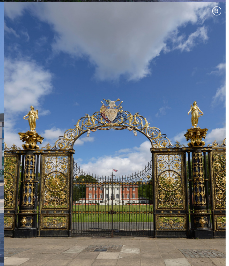
① ↪ Walton Hall & Gardens, Warrington ② ↪ New Time Square, Warrington ③ ↪ 'The Golden Gates' Outside Warrington Town Hall Centre