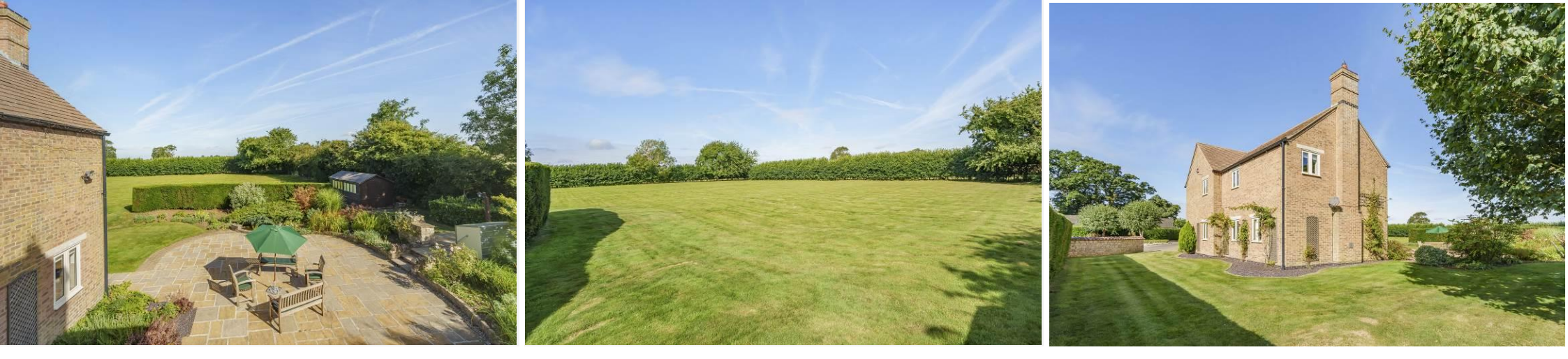
Stunning Detached Property with 1.2 Acres of Landscaped Gardens and Paddock

Tucked away in a serene location on a private driveway, this beautifully presented detached property occupies a generous 1.2-acre plot (STS), featuring immaculate landscaped gardens and a paddock. Nestled within a cluster of just five homes, this residence offers both privacy and a sense of community. This spacious home provides flexible and well-proportioned living spaces throughout, including an inviting entrance hall, a cloakroom, three reception rooms, and a large open-plan kitchen. The property also boasts a utility room, four double bedrooms, including a master suite with an ensuite bathroom, a family bathroom, and a large double garage.