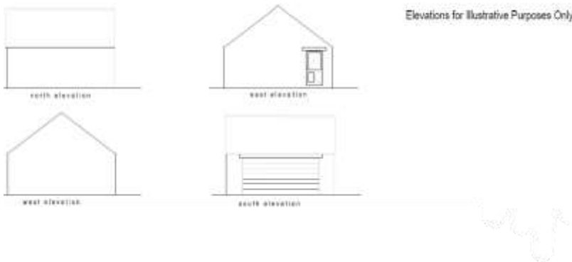
Elevations for illustrative purposes only