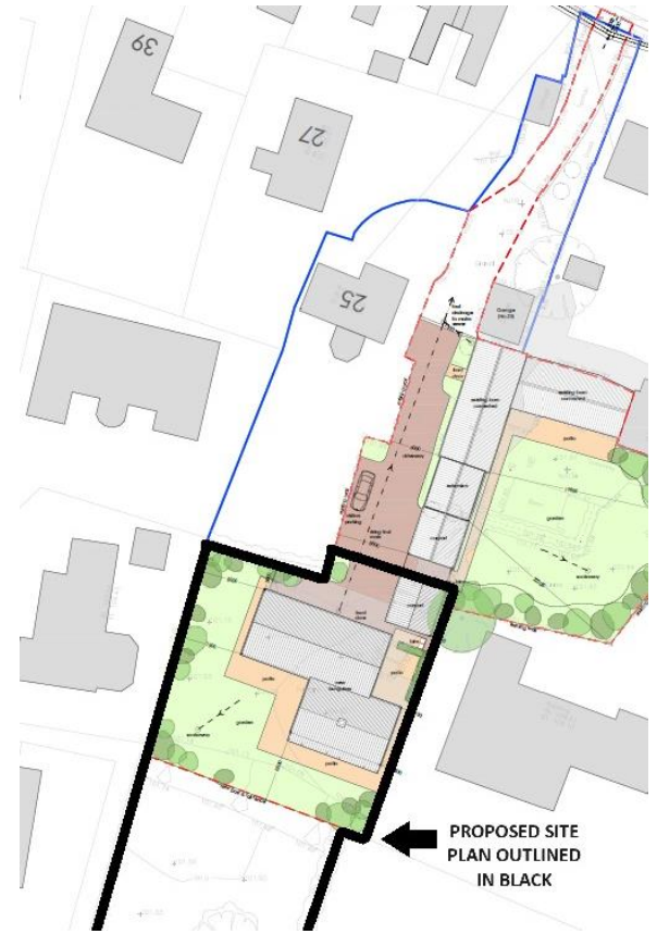
Proposed site plan