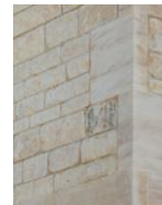
DRESSED LIMESTONE (ASHLAR)