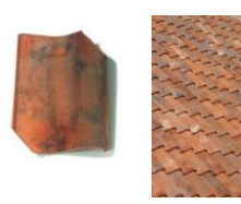
Sandtoft Koramic Old Hollow 451 Victorian