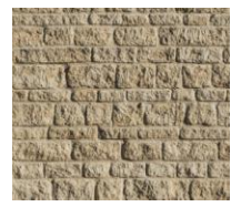
CLIPSHAM LIMESTONE (WHERE INDICATED)