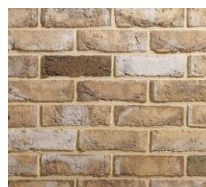
TBS Weathered London Yellow Stock Facings

coursed limestone rubble with Ashlar quoins to plinth and Porch walling