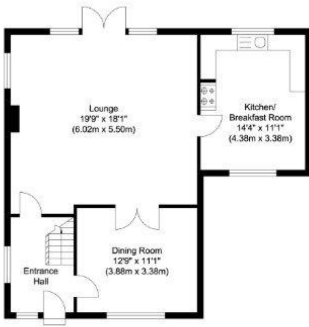
Ground Floor Approximate Floor Area 745.93 sq. ft (69.30 sq. m)