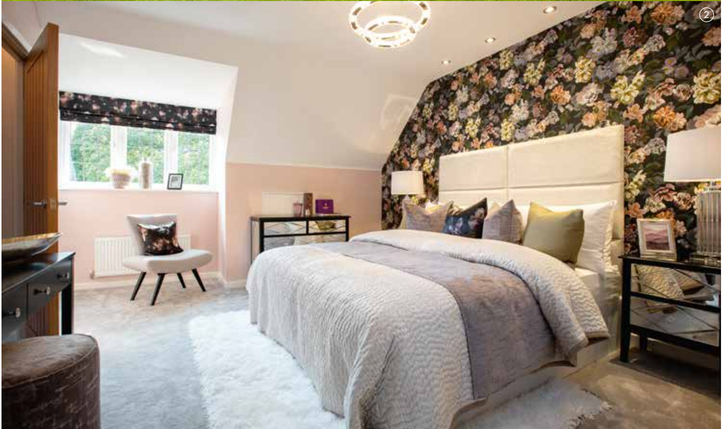
① ↳ Wistaston Brook ② ↳ Typical Interior