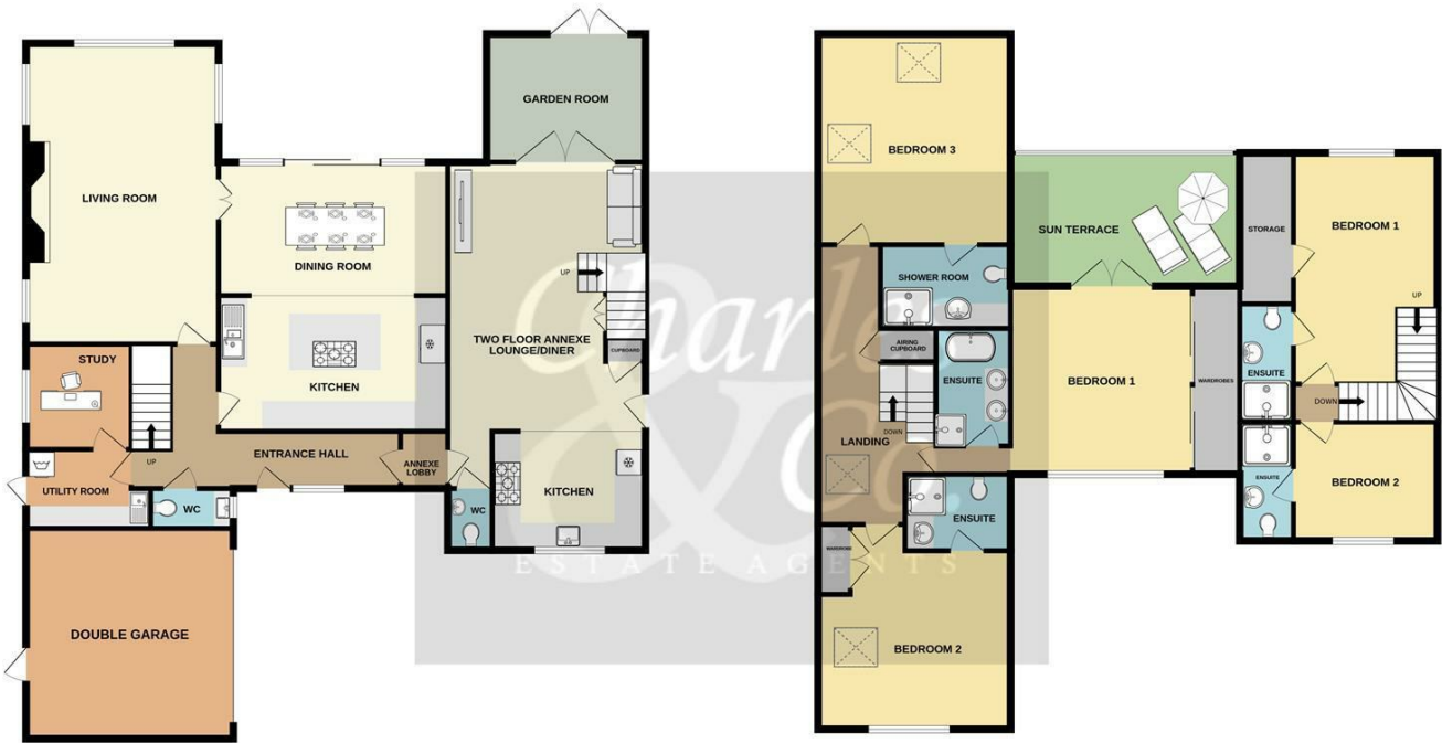
TOTAL FLOOR AREA : 3235 sq.ft. (300.6 sq.m.) approx.

Whilst every attempt has been made to ensure the accuracy of the floorplan contained here, measurements of doors, windows, rooms and any other items are approximate and no responsibility is taken for any error, omission or mis-statement. This plan is for illustrative purposes only and should be used as such by any prospective purchaser. The services, systems and appliances shown have not been tested and no guarantee as to their operability or efficiency can be given. Made with Metropix ©2024