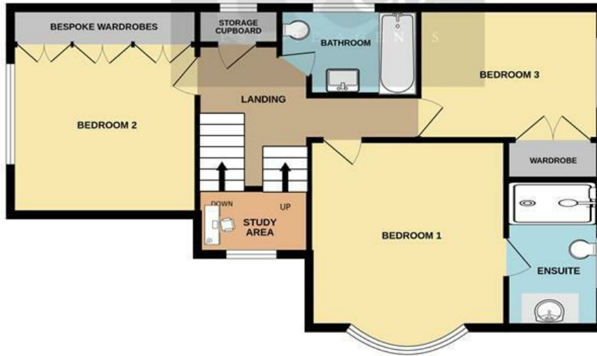
TOTAL FLOOR AREA: 1430 sq.ft. (132.9 sq.m.) approx.

Whilst every attempt has been made to ensure the accuracy of the floorplan contained here, measurements of doors, windows, rooms and any other items are approximate and no responsibility is taken for any error, omission or mis-statement. This plan is for illustrative purposes only and should be used as such by any prospective purchaser. The services, systems and appliances shown have not been tested and no guarantee as to their operability or efficiency can be given. Made with Metropix ©2024