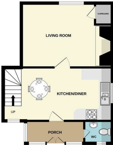
GROUND FLOOR 574 sq.ft. (53.4 sq.m.) approx.