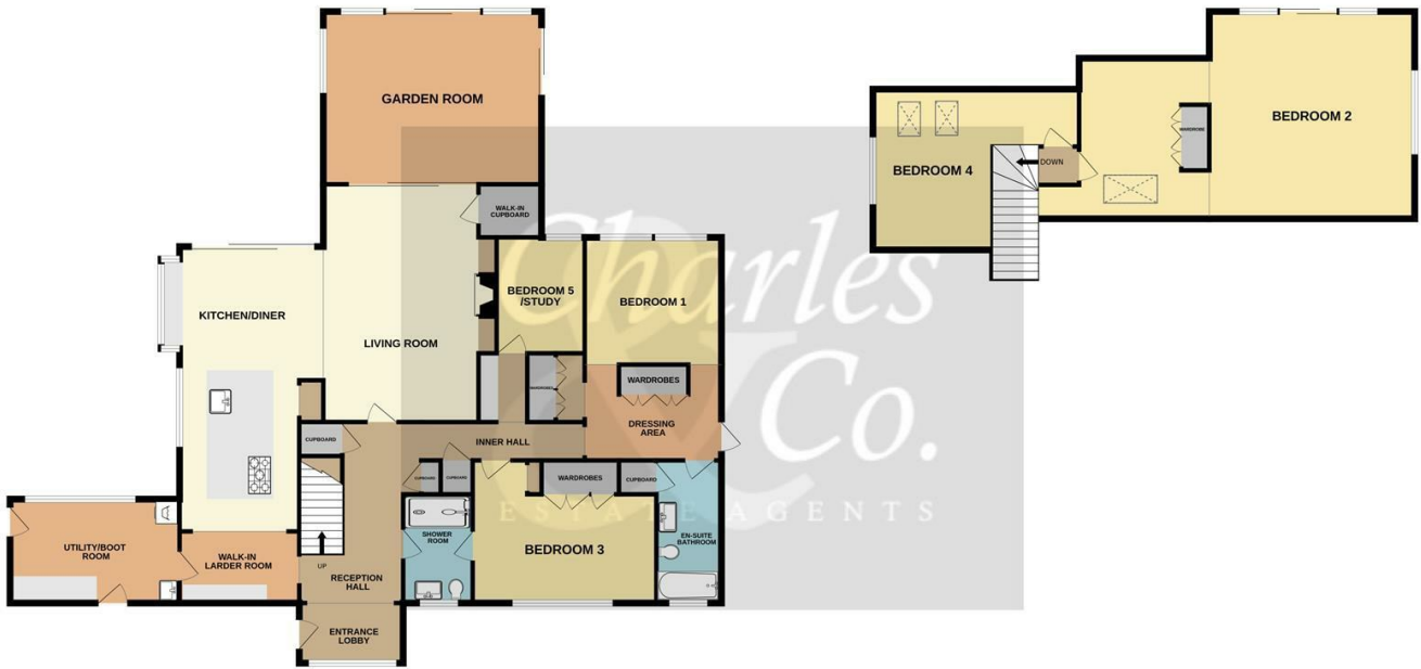
TOTAL FLOOR AREA : 2751 sq.ft. (255.6 sq.m.) approx.

Whilst every attempt has been made to ensure the accuracy of the floorplan contained here, measurements of doors, windows, rooms and any other items are approximate and no responsibility is taken for any error, omission or mis-statement. This plan is for illustrative purposes only and should be used as such by any prospective purchaser. The services, systems and appliances shown have not been tested and no guarantee as to their operability or efficiency can be given. Made with Metropix ©2023