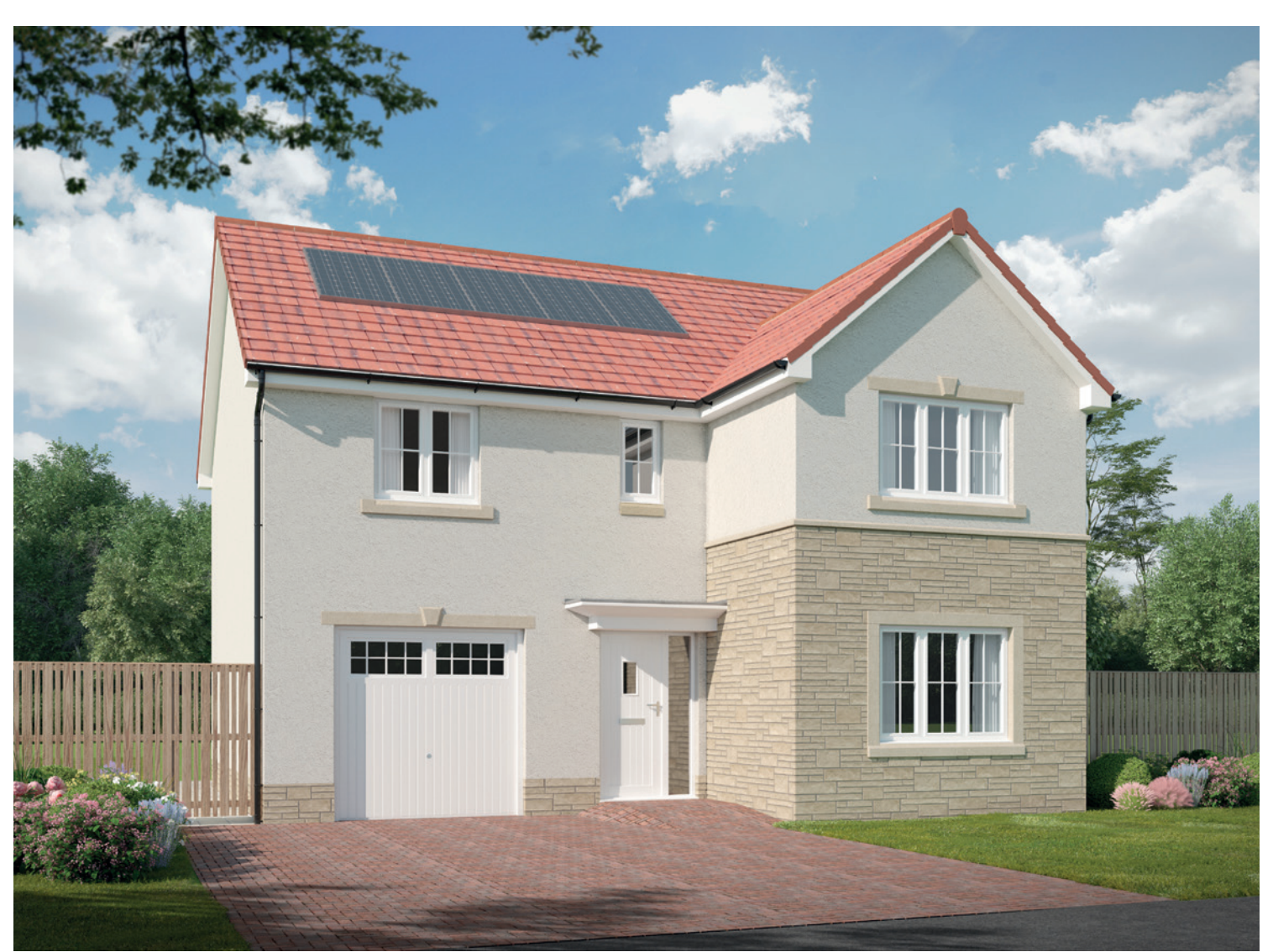
Please note Photo Voltaic (solar) panels shown above are indicative only. The location and number of panels are dependent on plot orientation. Please see Sales Advisor for details.

FOUR BEDROOM DETACHED HOME WITH INTEGRAL GARAGE